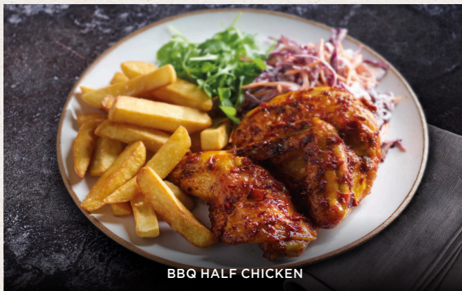
BBQ HALF CHICKEN

Butternut squash, lentil and chickpea curry served with rice and poppadom