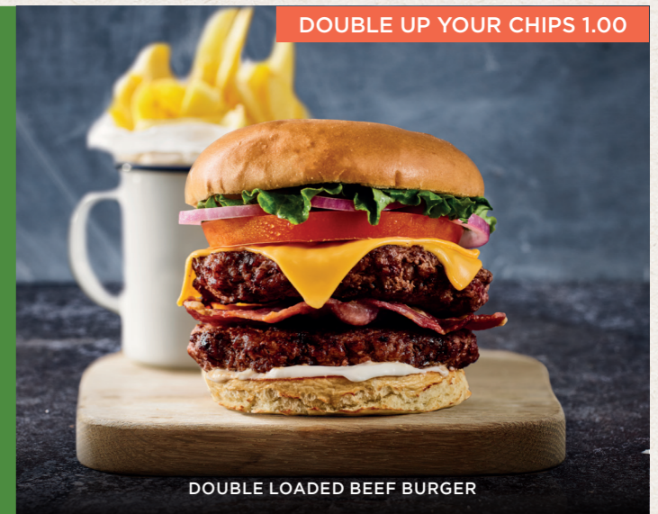
DOUBLE LOADED BEEF BURGER

Our chicken burger topped with double cheese, double back bacon, red onion, tomato, lettuce and mayonnaise