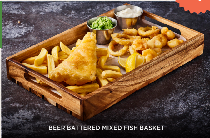
BEER BATTERED MIXED FISH BASKET